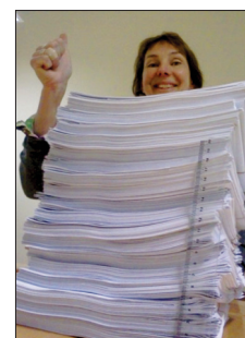
Figure 1: Paperwork required for regulatory review of the research described in panel 1

In 2010, a group of researchers in Sweden wanted to pool data from several cohort studies to identify risk factors for subarachnoid haemorrhage. They identified about 20 studies, and spent about 300 h contacting all investigators and getting signed data-sharing agreements and data security processes agreed. Sweden has a central research ethics committee to approve projects. The team recorded the time taken for each step of the approval process. About 200 h of office time was spent on the ethics approval and resubmission process alone. The research ethics committee wanted to see all information that the participants of all cohorts had been given about the purpose of the study. These documents had to be provided as 18 copies and submitted manually. It took the team 6 months to collect all the information sheets from the 20 different cohorts, several of which began recruitment in the 1960s and for which little knowledge about what information was given by whom to whom in the recruitment phase was poor. The research ethics committee eventually had the team advertise in national newspapers about the pooling project, listing all original cohorts so that all individuals who did not want the team to use their data for this project could withdraw their consent for the study. Not one participant withdrew. It took more than 3 years to reach the stage of pooling data from the cohorts, ready for analysis.